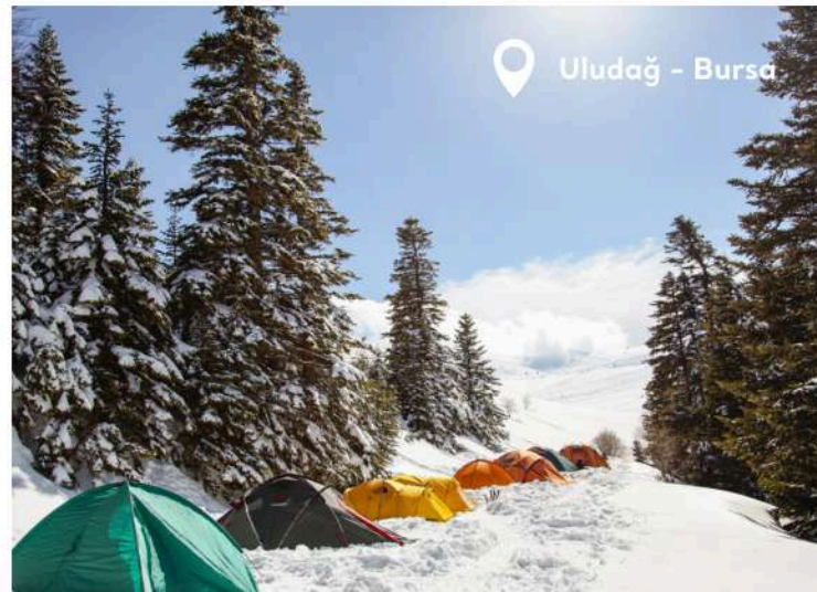
Uludağ - Bursa

In the resort, you can find coffeeshops, ATV, snowbike, and many other facilities for skiers. The total bed capacity is 350.