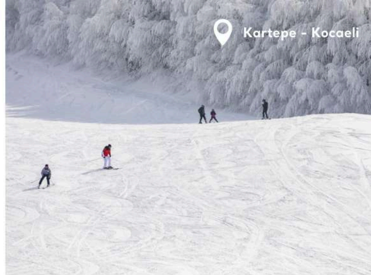
Kartepe - Kocaeli