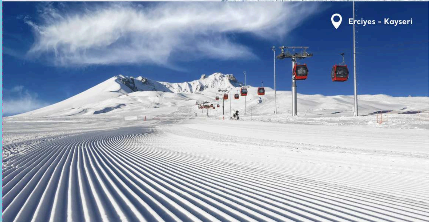
Erciyes - Kayseri