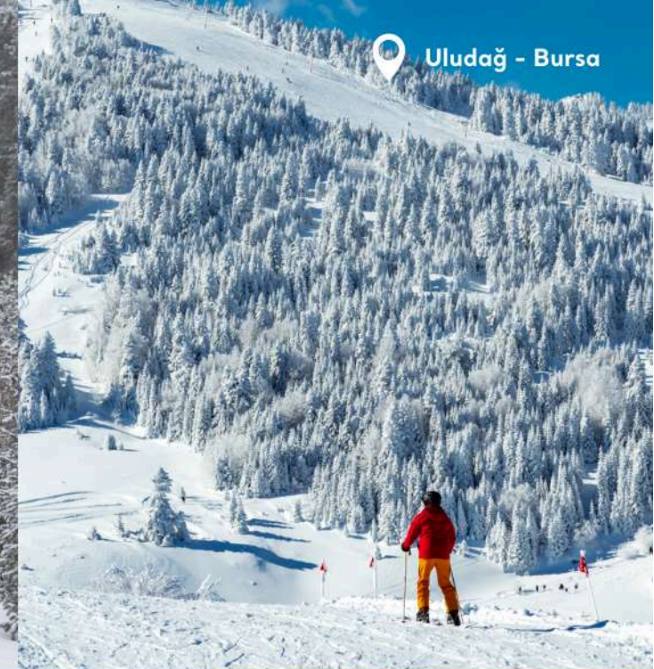
Uludağ - Bursa