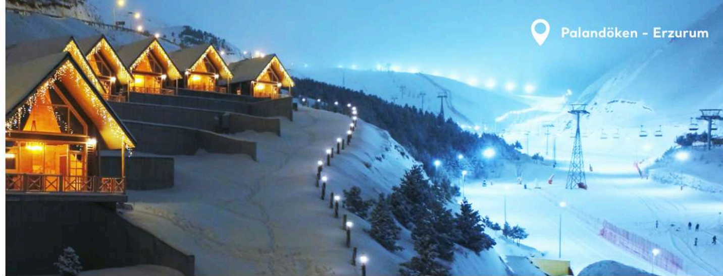
Palandöken - Erzurum

You can also find restaurants, coffeeshops, ski centers, Turkish bath and spa, conference venues, shops, and more on site. The total bed capacity is 3200.