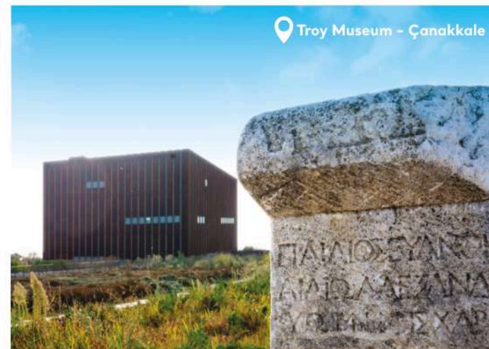
Troy Museum - Çanakkale

The ancient city of Ephesus, an archaeological site with peach orchards, olive groves and fertile lands with poplars as far as the eye can see, is on the UNESCO World Heritage Site List. The ancient city still reflects the glory of antiquity with its magnificent theatre still hosting concerts and events, the Celsus Library, well-preserved terrace houses, and the Temple of Artemis, which was one of the seven wonders of the ancient world. The floor mosaics of terrace houses represent the art and delicate aesthetics of the period.