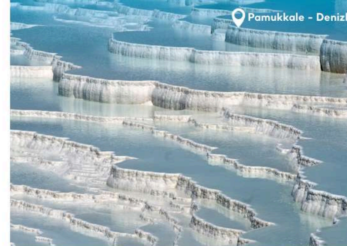
Pamukkale - Denizli

The Ancient City of Knidos is located at the furthest point of the Datça Peninsula where the Aegean Sea and the Mediterranean meet. Connected to the mainland with a narrow, sandy isthmus, all interior walls of the ancient city of Knidos is filled with archaeological remains. The ancient city's harbours are now popular anchorages for day cruisers and sailboats stopping for lunch, swimming, and visiting the city ruins.