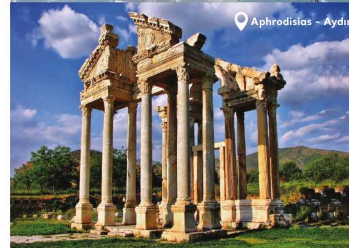
Aphrodisias - Aydin