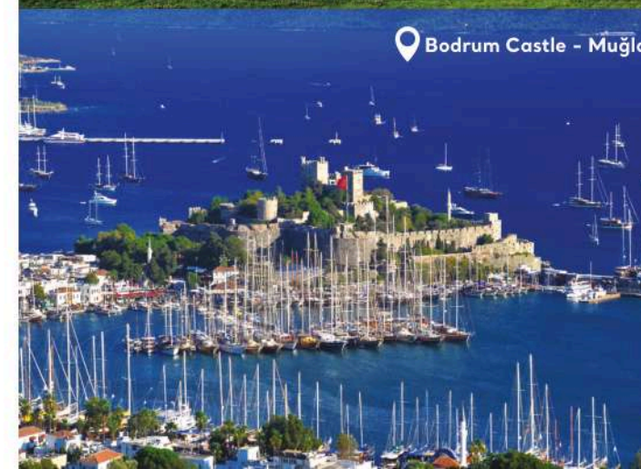
Bodrum Castle - Muğla

Slow down the pace of life, savour every moment and let yourself be inspired by all that the region offers.