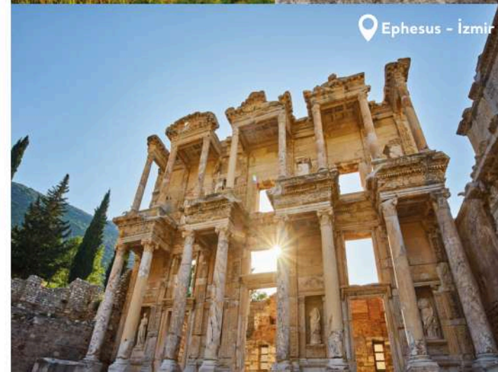
Ephesus - İzmir